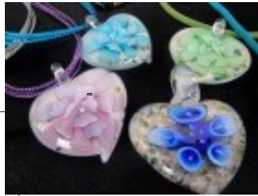
Remembrance Heart Necklaces – soft colors