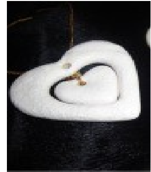
Heart within a Heart Grief Watch