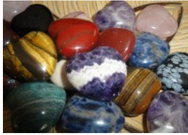
Stone Remembrance Hearts