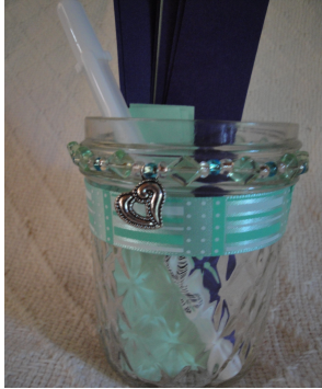
A 'Grateful' Jar to write thoughts and grateful feelings whenever you have them