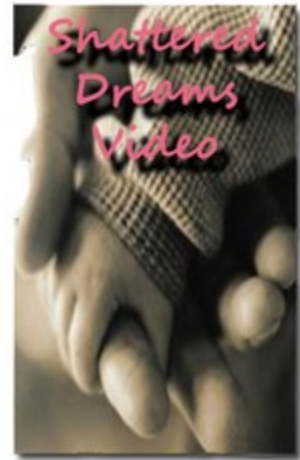
A video specifically for Family & Friends 12 minutes packed full of ideas of what to say and how to help...by Sherokee